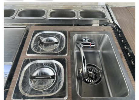
- Sink -