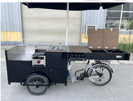
- Counter -