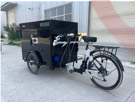
- Basic Configuration -