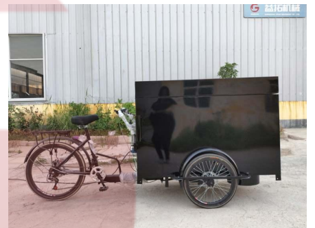
- Basic Configuration -