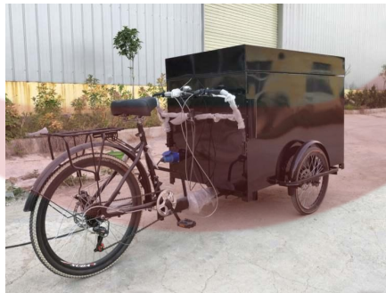
- Basic Configuration -