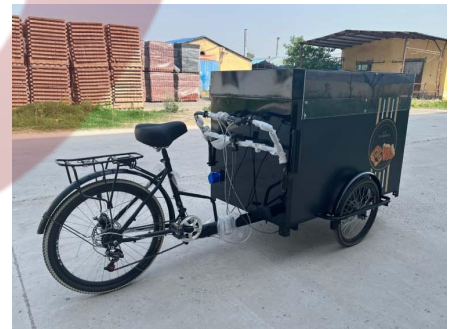
- With Vinyl Graphics -