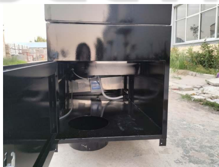
- Storage -